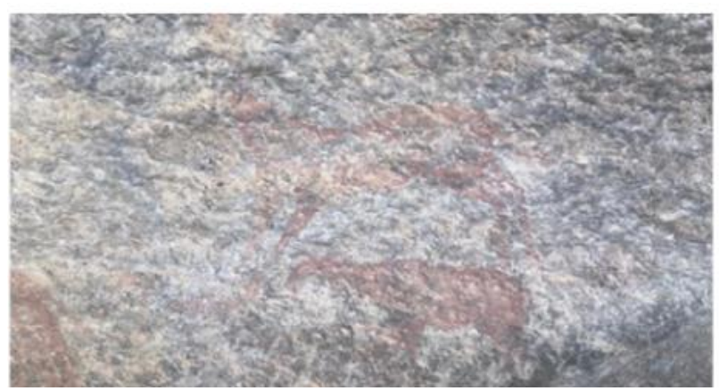
Fig. 3: Naturalistic Elands are Painted at Nkere Rock Shelter

There is an isolated granite slab with a single depression (hole) larger than a cup mark (cupule). The depression is almost circular, measuring 28 x 29 cm. In cross-section, it is basin-shaped and about 10 cm deep (Figure 5). The hollow may have been formed through pecking or grinding with a hammerstone. Many grinding hollows have been found in the Mwanza and Geita regions.<sup>20</sup> The sites in this locality are perfectly suited for public display and tourism because they are in a very good state of preservation. The roads and accessibility to the sites are reliable although they are surrounded by farmlands alongside the homesteads (Figure 4).