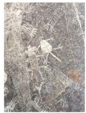
Fig. 8: Bantu Speakers' Rock Art in Musule Village, the White Zoomorphic Figures are Executed in White Colour