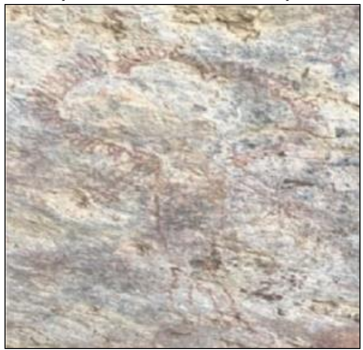
Fig. 2: Stylized Monster-like Human Figure with Spiky Hair at Itramuka Rock Shelter

underway, and some are currently housed at the Max Planck Institute of Science of Human History, Germany and thus cannot be discussed in this paper momentarily (appendix 4). This discovery at Itramuka needs further analysis and dating.