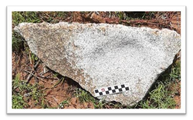
Fig. 5: An Isolate Granite Slab with an Engraved Hollow/Cupule at Nkere/Kihade Village