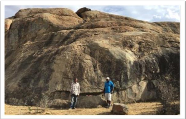
Fig. 4: Rock Engravings (Cupules Art) in Nkere Village