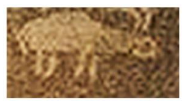
Fig. 6: Dusky-White Paintings at Mau Site

stencils. The painted images are in semi-naturalistic forms and in both frontal and profile aspects. The subject matter includes wild animals, 11 giraffes and 1 elephant (Figure 6). There are also a few anthropomorphic figures. Stylistically, the pictographs fall under what, for want of a better term, has been referred to as the Bantu speakers' art tradition ('the dirty white' paintings), in which the pigment turns out to be ashy or dusky white due to weathering or other chemical and biological factors. The animal friezes, which decorate the ceiling and a wall of the cave, are semi-naturalistic silhouettes in which details are missing, borders vague and the finished product moderately fine.