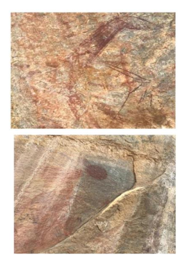
Fig. 9: Naturalistic, Schematic, and Stylized Figures as well as Geometric Designs, Concentric Rings, and Circles at Misughaa-Musule Site

Although fish on the whole have been rarely found painted by these prehistoric painters, they have been found painted together with reptiles in the Misughaa cluster of sites (Musule II rock shelter). In addition to animal and human depictions, symmetric and asymmetric designs were found.